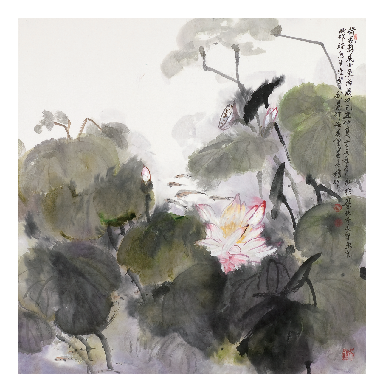
荷花影下小魚游 彩墨 80×60cm Small Fish Playing under Lotuses Color Painting

Under groups of lotuses and their shades in a lotus pond, there are some small fish freely swimming around. It shows the sense of clean and fresh ecological environment.