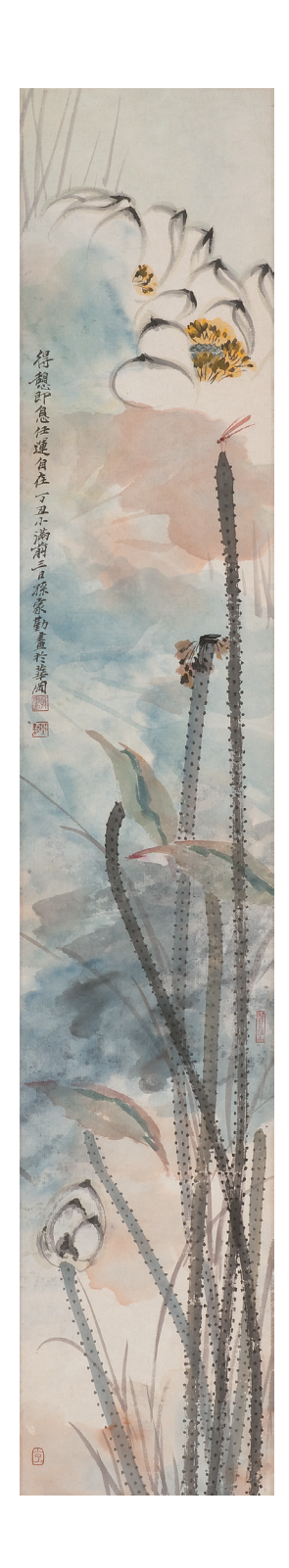
蓮塘小憩 彩墨 141.5×24.5cm A Little Rest on Lotus Pond Color Painting

孫教授自創破墨畫法,並創造出具 多元面貌的山水與花鳥畫;或婉約 柔順,清新內斂;或恬淡雍容,氣 韻生動。透露出孫教授雖高齡,仍 努力創新的熱忱與活力。